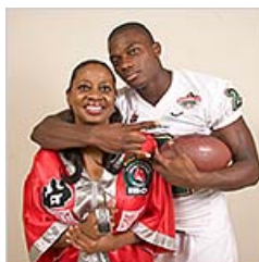
Receiver Has His Mother in His Corner