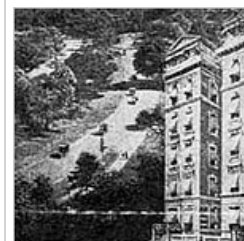
An Alcoholic's Savior: God, Belladonna or Both?

Home | World | U.S. | N.Y. / Region | Business | Technology | Science | Health | Sports | Opinion | Arts | Style | Travel | Jobs | Real Estate | Autos | Back to Top Copyright 2010 The New York Times Company | Privacy | Terms of Service | Search | Corrections | RSS | First Look | Help | Contact Us | Work for Us | Advertise | Site Map