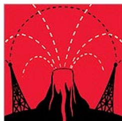
Using Teleconferencing as Air Travel Stalls