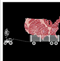
Room for Debate: U.S. Aid for Local Farmers?